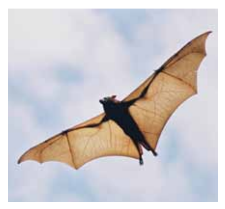
BAT Order: Chiroptera