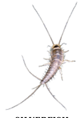
SILVERFISH Lepisma saccharina