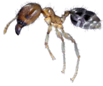
BIG HEADED ANT Pheidole megacephala