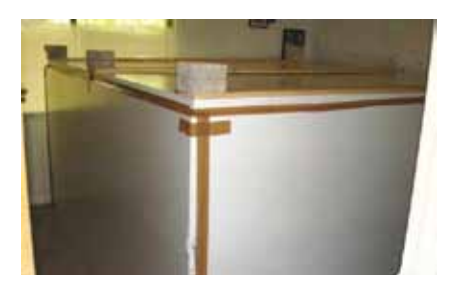
FIGURE 10 • A "heat chamber" made of insulated polystyrene sheets built around a pile of furnishings.