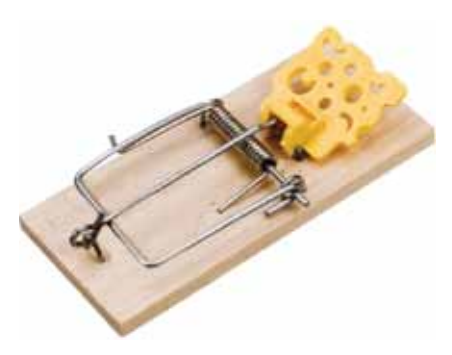
FIGURE 17 • A mouse trap with a square of plastic on the trigger to increase its effectiveness.

and cockroaches. Cotton can be an acceptable alternative that rodents may attempt to take for nesting material. To improve snap trap efficiency, a stiff square of cardboard or plastic can be placed on the trigger to make it larger (Fig. 17). An enclosed snap trap can be used if the interior of the trap is visible. Traps should be placed in locations where they should be encountered by foraging rodents. This includes sites along walls, obvious pathways, in front of known access points, or situations in which rodents are forced to encounter the trigger. If placed along a wall, the trap should be oriented perpendicular to it with the trigger facing inward. Trapping locations and periods should be varied to discourage trap avoidance.