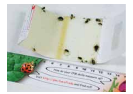
FIGURE 5 • A sticky-trap monitor with captured German cockroach nymphs, suggesting an infestation.