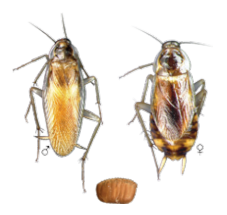
BROWNBANDED COCK-ROACH (male and female with ootheca) Supella longipalpa