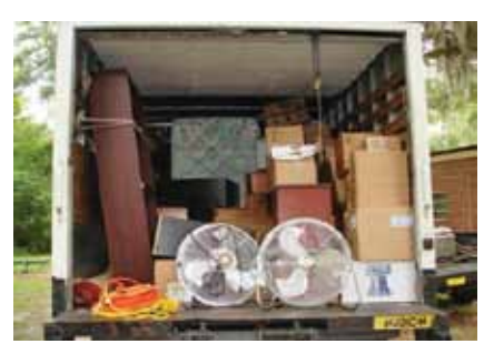
FIGURE 11 • Items removed from an infested apartment and placed into a mobile fumigation chamber.