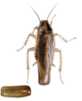
GERMAN COCKROACH WITH ITS OOTHECA Blattella germanica

Action Threshold: Observe two live cockroaches in a room or on a monitoring board.