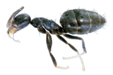
ODOROUS ANT Tapinoma sessile