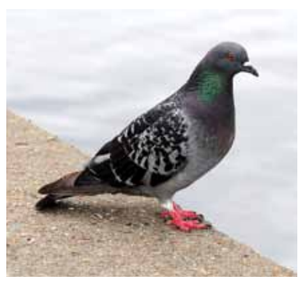
ROCK DOVE "PIGEON" Columba livia