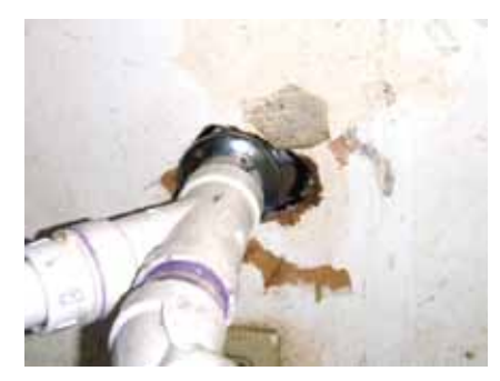
FIGURE 2 • An improperly installed escutcheon plate can be repaired by the college/university maintenance section.

Preventative measures include continuous and emergency maintenance, educating residents about sanitation and pests, routine inspection and monitoring for pests, and landscaping that discourages pests from becoming established.