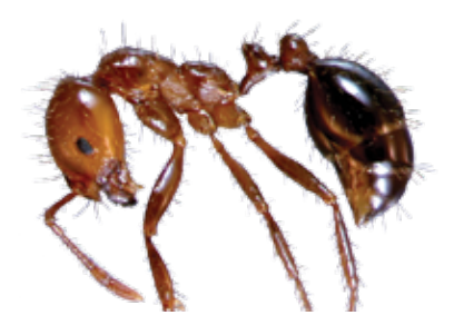
RED IMPORTED FIRE ANT Solenopsis invicta