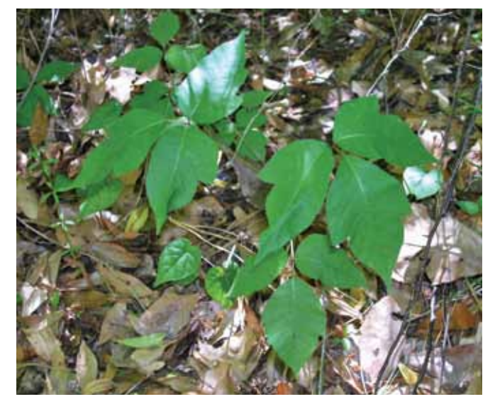
FIGURE 18 • Poison ivy , Toxicodendron radicans.

Most weeds are only considered aesthetically undesirable. However, noxious plants, such as poison ivy can cause severe rashes (Fig. 18). Plants with sharp spines or stinging hairs can be hazardous, such as thistles or nettles, respectively. In addition, some weeds are highly toxic, e.g., pokeweed, Phytolacca americana , and should be removed from areas near buildings managed by the college/university. Children can be attracted to the poisonous pokeweed berries. Developing a tolerance for weeds that pose no health risks, such as dandelions or crabgrass, is preferred over chemical treatments in the college/university IPM program.