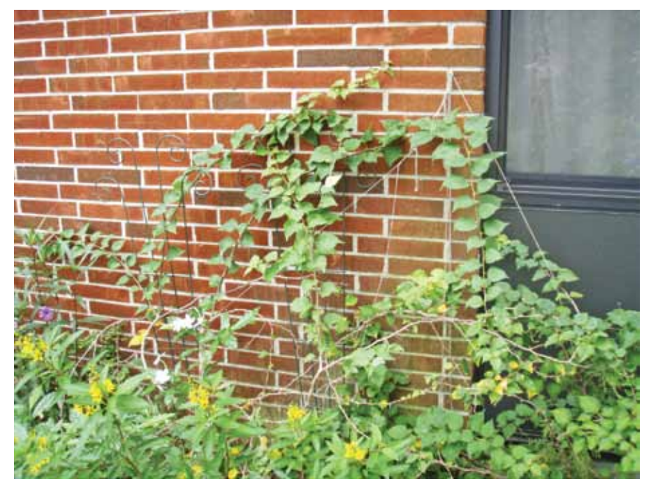
FIGURE 7 • Vining plants can give insects access into buildings.