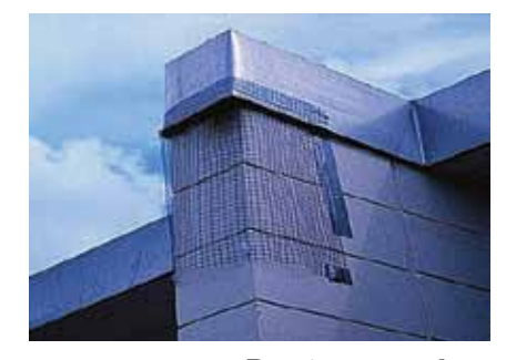
FIGURE 14 • Devices, such as bat netting, can be placed where birds or bats reside to allow one-way movement out of the cavity, thus they can also be used for exclusion.

Chemicals should not be used to control birds or bats.