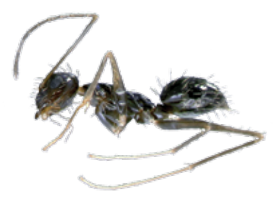
CRAZY ANT Paratrechina longicornis