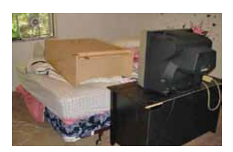
FIGURE 9 • Items placed in a pile at the center of a room.