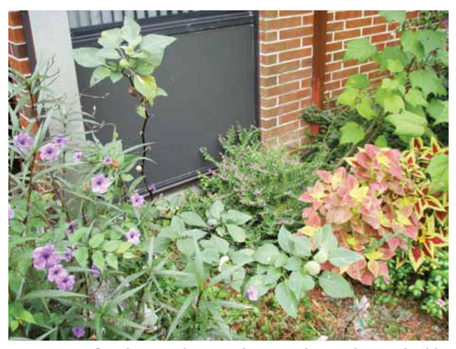
FIGURE 6 • Landscape plants and materials too close to buildings can provide harborages and entry access routes for insects.