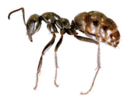
BLACK CARPENTER ANT Camponotus pennsylvanicus