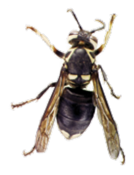
BALD-FACED HORNET Dolichovespula maculata