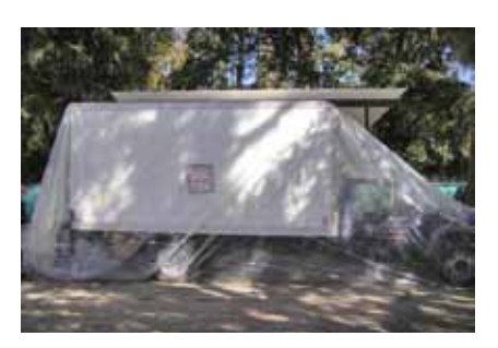
FIGURE 12 • Fumigation chamber wrapped in polyethylene sheeting.

and adding two space heaters and two box fans to produce and distribute the heat (Fig. 9). The box is sealed with tape (Fig. 10) and the temperature is measured by a digital thermometer with a long cord, e.g., thermocouple or wireless indoor/outdoor thermometer. The thermometer sensors should be placed in linen piles or under pillows to determine if well insulated areas reach the critical temperature. Residents must not attempt this dry heating procedure.