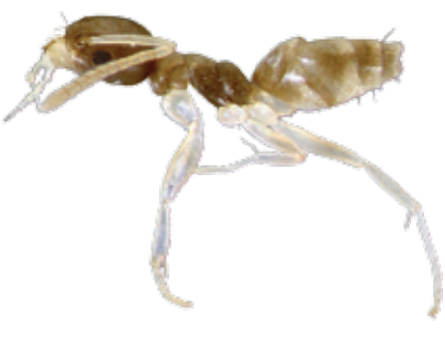
GHOST ANT Tapinoma melanocephalum