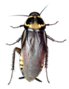
AUSTRALIAN COCKROACH Periplaneta australasiae