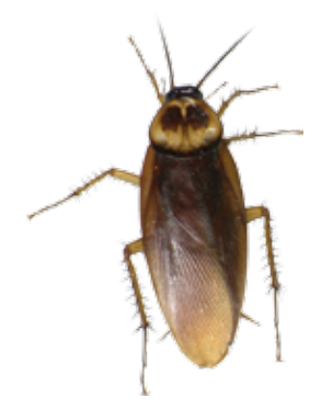
AMERICAN COCKROACH Periplaneta americana