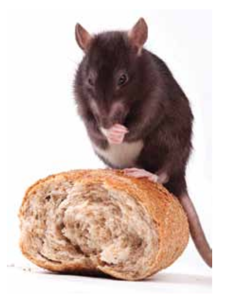
FIGURE 16 • Uncovered trash attracts rodents.

Action Threshold: Observe one rodent indoors or outdoors when destroying property. Rodent nesting in wall voids.