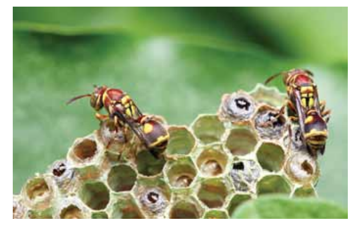
FIGURE 13 • Paper wasps on a nest