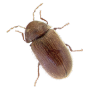
DRUGSTORE BEETLE Stegobium paniceum

Action Threshold: Observe at least three live pests in a room.